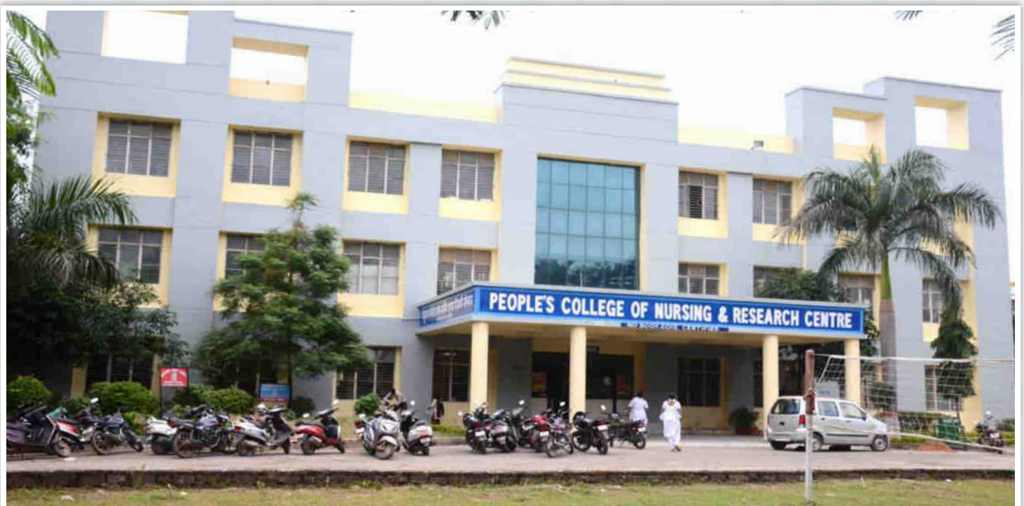
People's College of Nursing & Research Centre