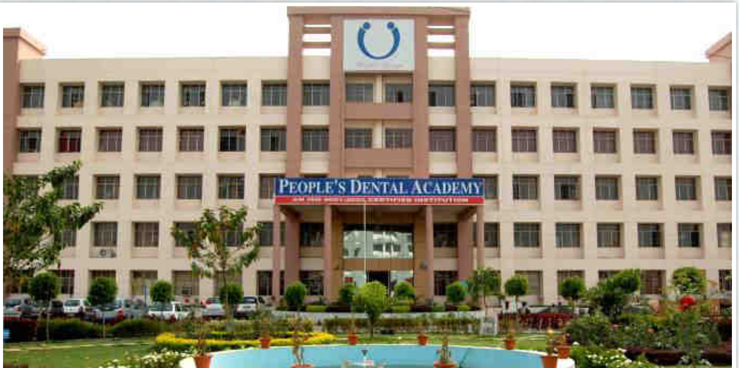
People's Dental Academy