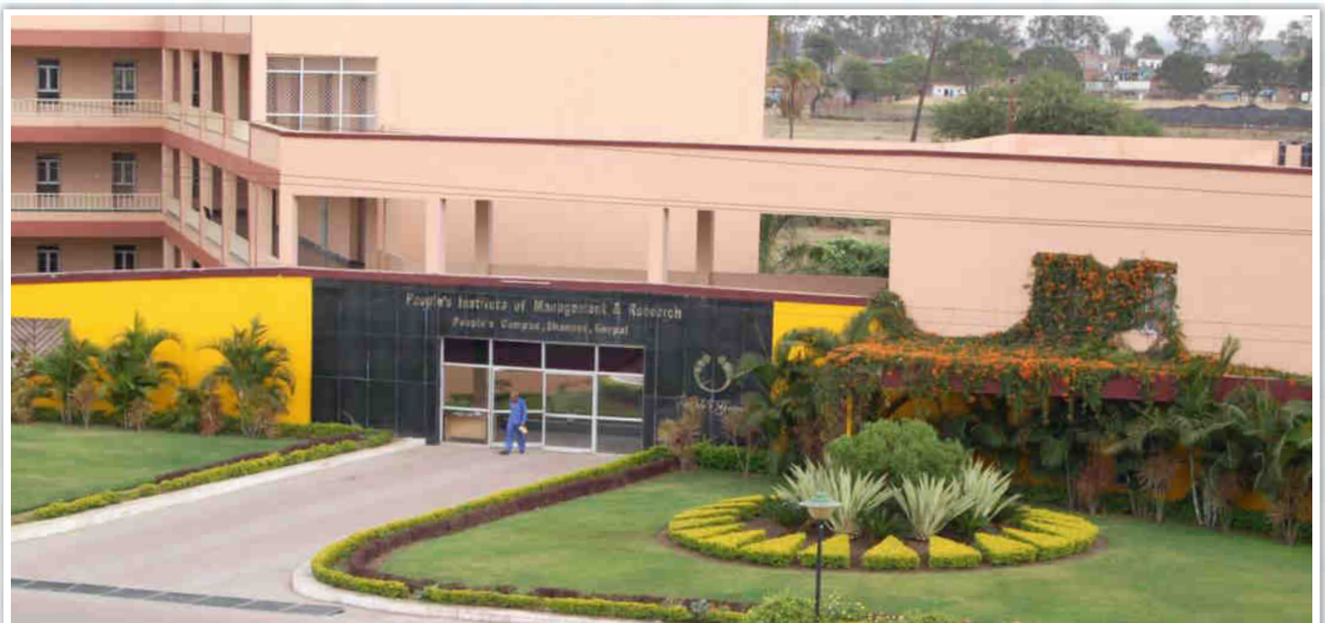
People's Institute of Management & Research