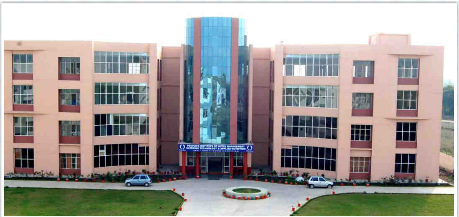
People's Institute of Hotel Management, Catering Technology & Applied Nutrition