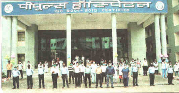
कोरोना को मात देकर घर लौट रहे लोगों के साथ पीपुल्स हॉस्पिटल, भानपुर का मेडिकल स्टाफ।

पीपुल्स संवाददाता • भोपाल editor@peoplesamachar.co.in