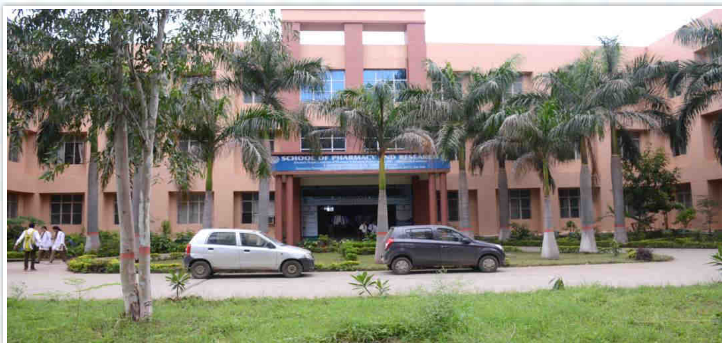
School of Pharmacy & Research