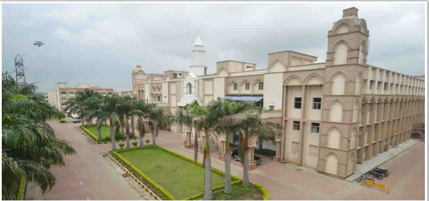
People's College of Dental Sciences & Research Centre