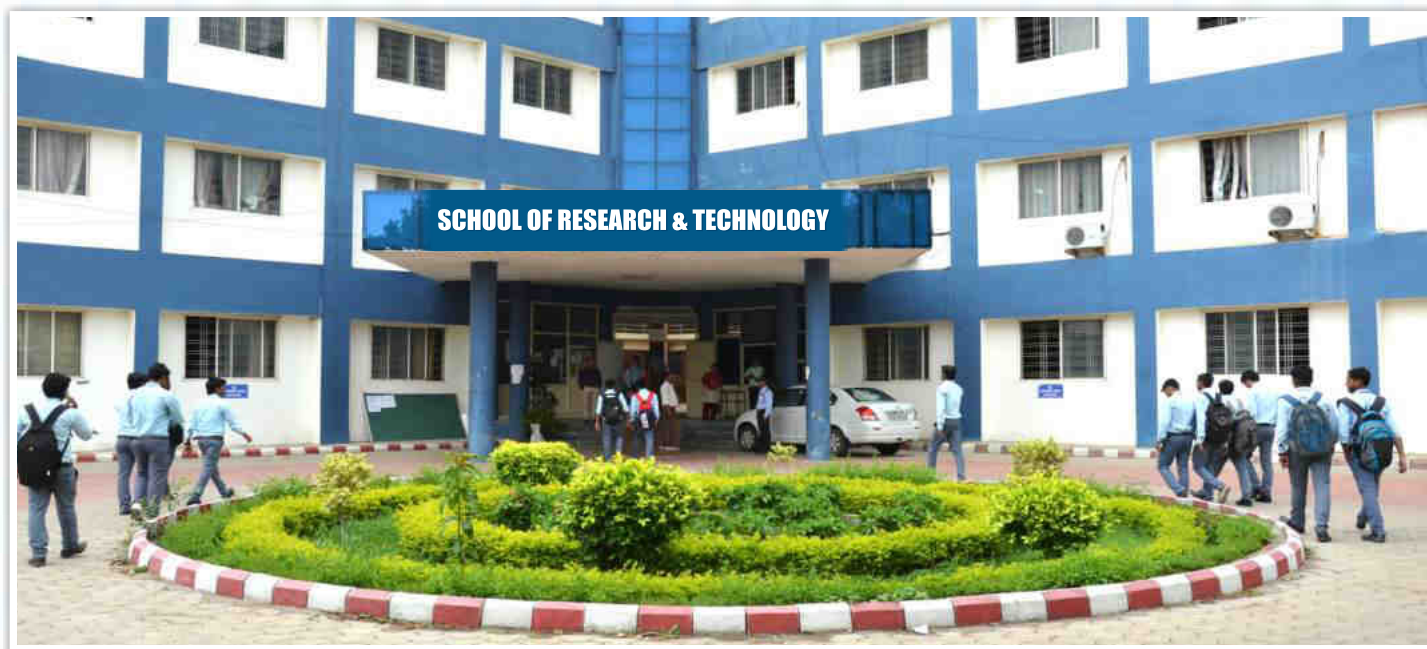
School of Research & Technology