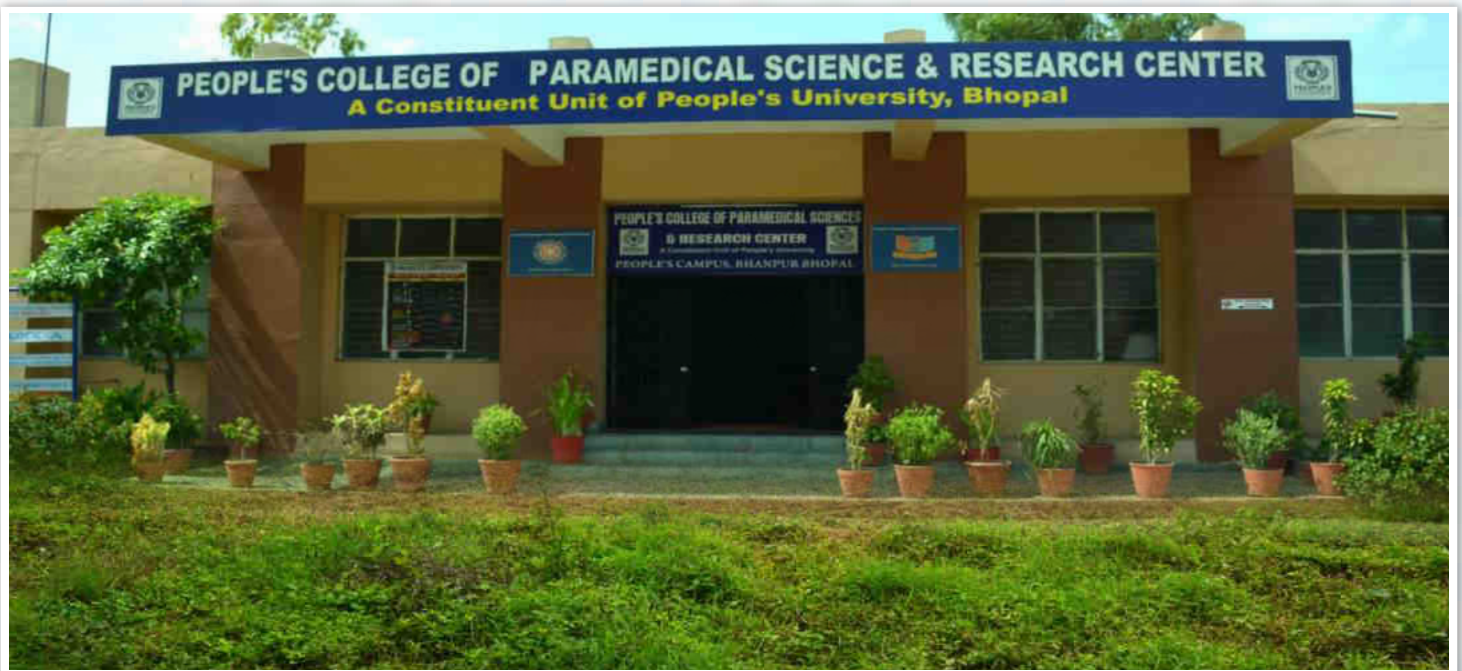
People's College of Paramedical Sciences & Research Centre