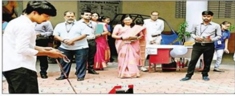
पीपुल्स संवाददाता • भोपाल editor@peoplesamachar.co.in